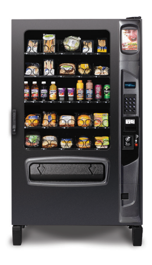
1040 W x 970 D x 1830 H