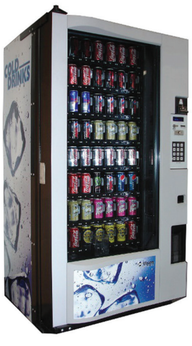
940 W x 900 D x 1820 H